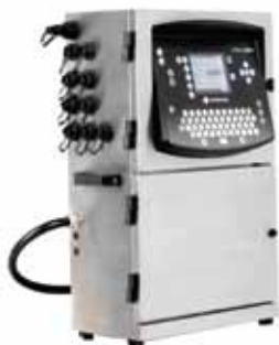
DOMINO INKJET CODER

(Other printers are available upon request)