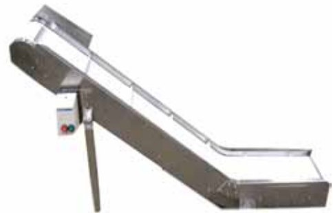
PRODUCT TAKEAWAY CONVEYOR

Continuous ink Jet printer large internal reservoir and nozzle