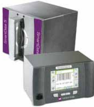
MARKEM SD5 THERMAL PRINTER