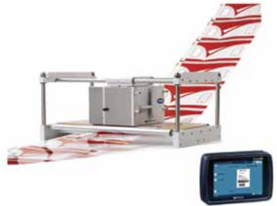
DOMINO V SERIES THERMAL PRINTER